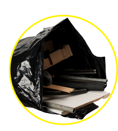
Flexible and durable